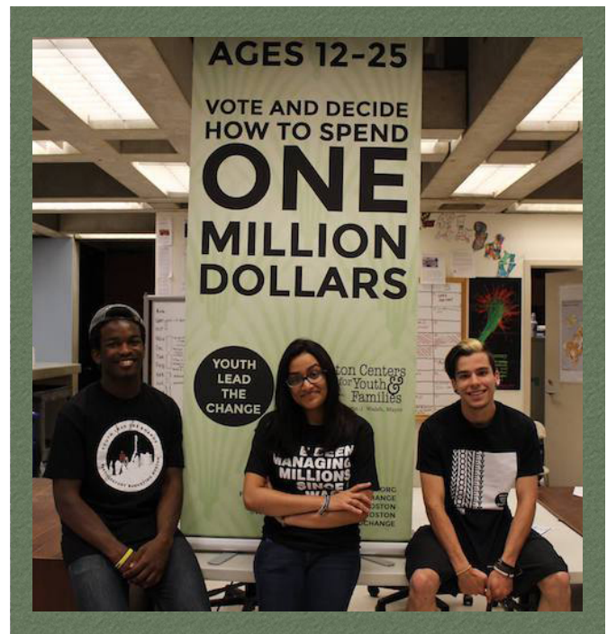
Boston youth PB participants promoting the process.

As with much other work in the field of youth civic engagement, there is a tendency to assume that youth PB is inevitably and always beneficial for both young people and democracy. While we believe that such processes certainly have substantial potential to enhance young people's political power and to produce more just and equitable communities, we also note a need for further scholarship to explore these questions empirically. Indeed, the challenges listed above suggest that it could also be