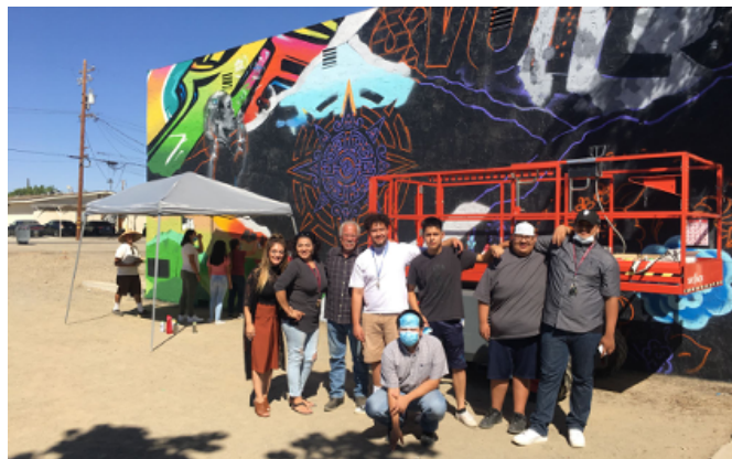
Avenal residents and artists from the Urbanist Collective pose in front of their local Central Valley Freedom mural in Avenal, CA.

At the same time, the research revealed the challenges and opportunities for conducting civics education in semi-rural and other communities that lack a history of student activism. Such efforts require significant work and problem-solving. Young residents were sometimes skeptical of CVFS leaders’ claims that they could contribute to improvements in their communities. Buy-in from adults often required persistence. For example, some high school administrators and staff in Kern, Tulare, Kings, Stanislaus, and San Joaquin Counties initially blocked students from registering and pre-registering voters on school grounds, even though the California state education code encourages nonpartisan voter registration on high school campuses. In response, students sought help from supportive school board members and community leaders to facilitate access to high schools.