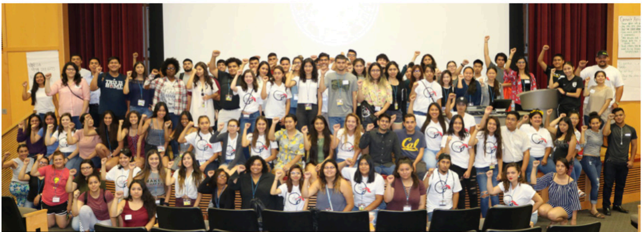
Youth leaders from across the Central Valley commit to take action in their local communities after attending the two-day Central Valley Rising Youth Leadership Conference.