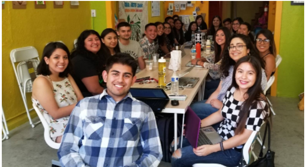
Central Valley Freedom Summer action research team meet at 99Rootz in Merced, CA to launch CVFS 2018 in June 2018.

Made possible through institutional support from UC Santa Cruz and UC Merced, the Central Valley Freedom Summer Participatory Action Research Project received generous financial support from the Irvine Foundation, The California Endowment, the Sierra Foundation, and individual donors.