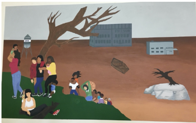
The completed Central Valley Freedom mural located in Fathers and Families of San Joaquin Valley in Stockton, CA.